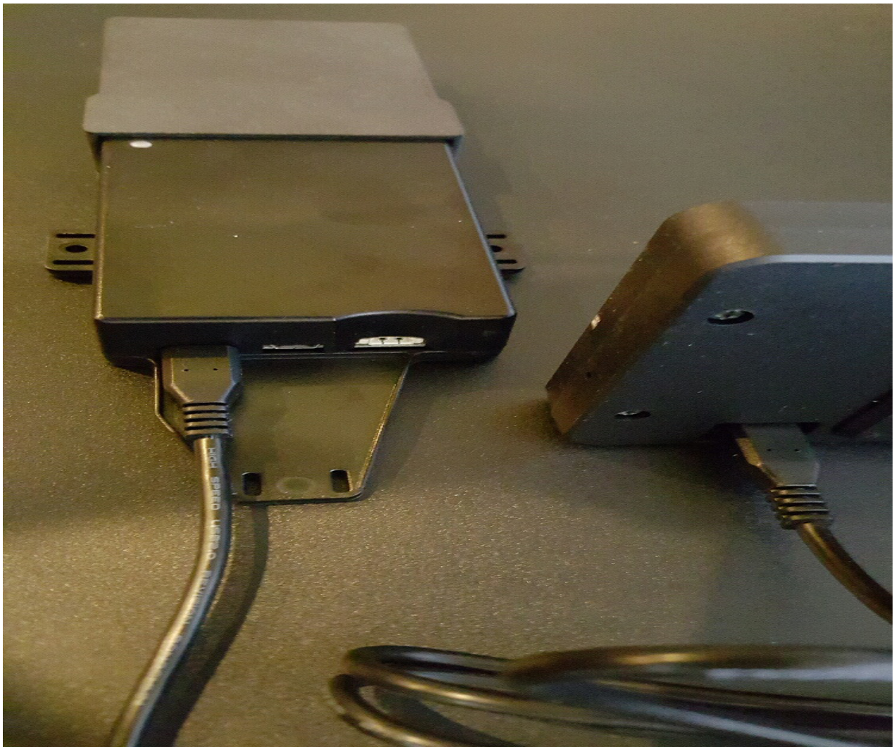
Connect controller and Main Unit with mini USB cable