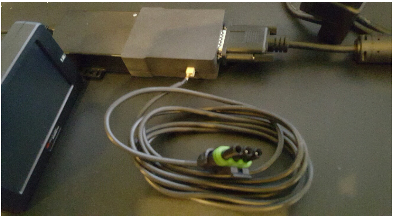
Connect RSA Unlock cable to Dongle

This wire must go into engine compartment to the under Hood Bus connector what is located below air horn and ECM