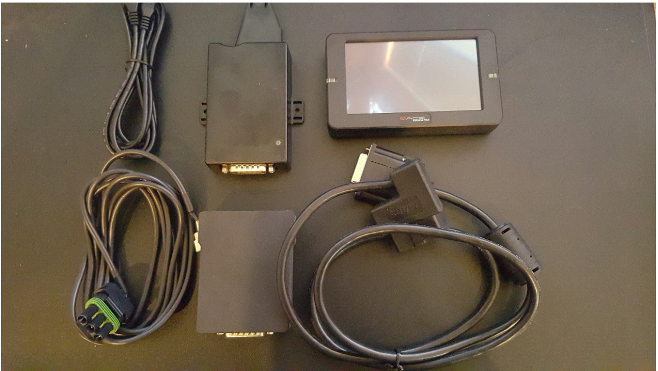
Picture showing important parts of Ultra box